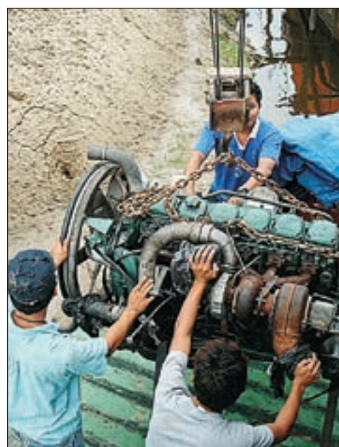
▲ Motor before repair without the radiator