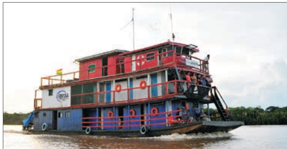
▲ The First Arrington

Here is our dilemma! The funds which were available for the ministry of the Arrington have been depleted! The necessary repairs cost almost $12,000.00. As the ministry continues along the rivers of Brazil, we desperately need to replace these funds and spend our time and efforts evangelizing the river people in Brazil. Our plans are to invite the leaders of BMA Brazil to help with this ministry as funds become available. As you read this article and view these photos, will you pray for the future of this worthy ministry? Will you consider a gracious one-time or monthly offering to help us reach this new area with the gospel? May God receive all the glory and may we rejoice in his blessings.