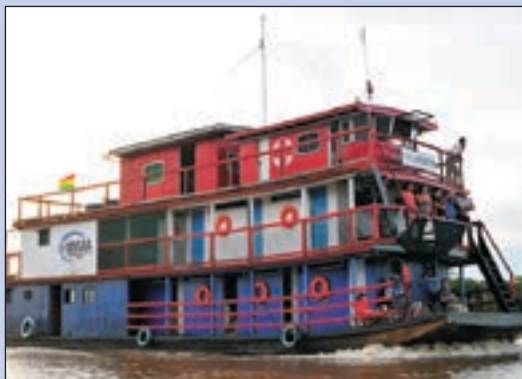
River of Blessing Page 7