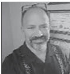
▲ Cliff Robertson