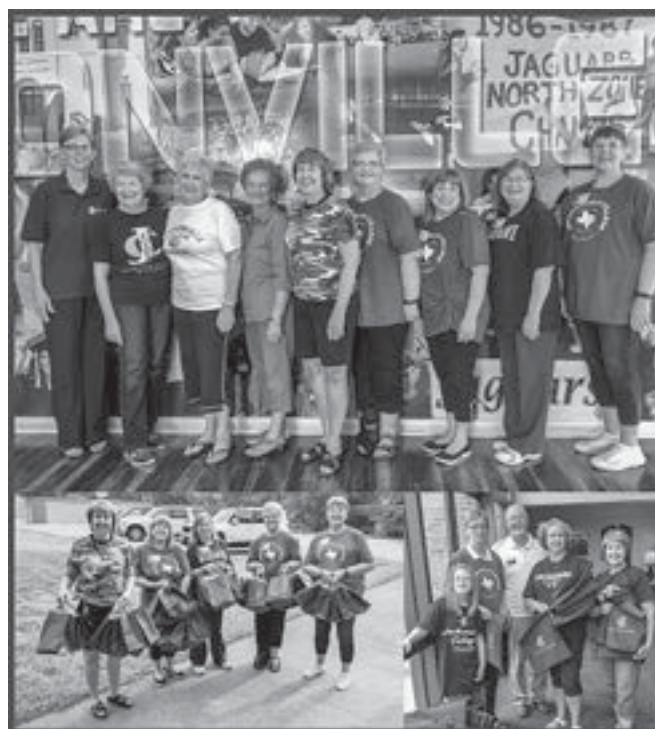
▲ JC alumni and friends put together 80 gift bags filled with goodies and delivered them to the girls on campus as they moved into their dorms. Volunteers also distributed JC backpacks to all students attending Fall 2018 orientation.