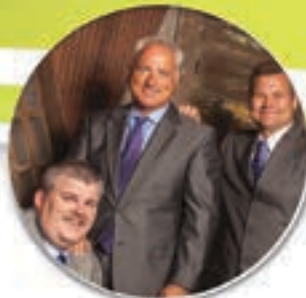
Concert N Him Gospel Trio