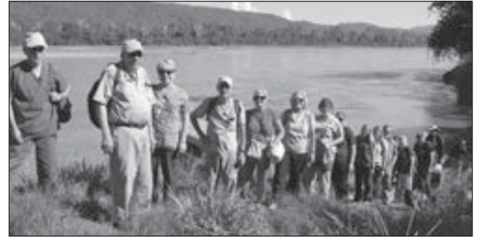
▲ BMMI team entering an Ashaninka village

During the week 200 people asked Jesus Christ to be their Savior. Praise the Lord! Praise the Lord that a mission can be