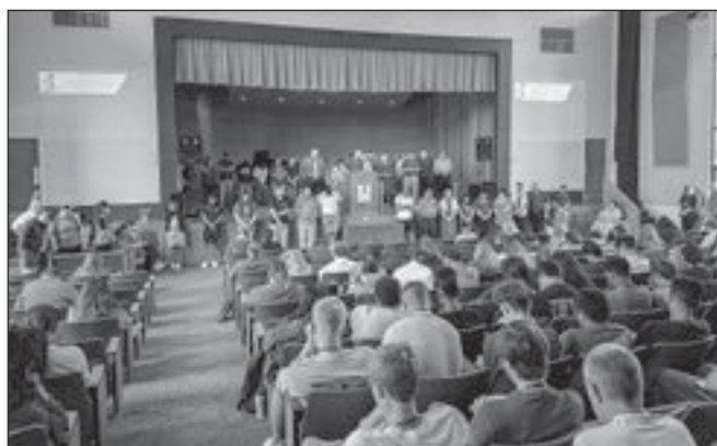
▲ First Chapel service of Fall 2018