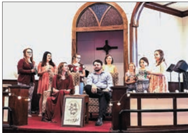
▲ White Bible Ceremony