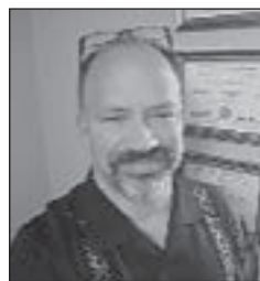
▲ Cliff Robertson

We currently three crews working in these homes. The work is exhausting and respirators are required. We also took everyone and got tetanus shots before we started as well. The support of the BMA has helped us move at a pace that has astounded many. We have one finished and the other two will finish tomorrow. We already have calls to go and help others. Some of these neighborhoods look like war zones. It's going to take months to get all the work done and begin the process of rebuilding. The scope of the work is mind-boggling! We are committed to do the very best we can with the opportunities we have been given to serve.