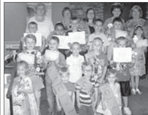
2nd place – North View Baptist Church, North Little Rock, AR - $701.69

Picture N/A Third place – Myrtle Springs Baptist Church, Quitman, TX - $508.61