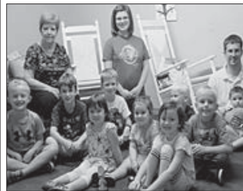
1st place – Denver Street Baptist Church, Greenwood, AR - $1,055.00

The Sunbeams of the BMAA collected $4,142.67 for our national project, the Shepherd Bag Ministry. Trophies were given to groups who raised $500.00 or more.