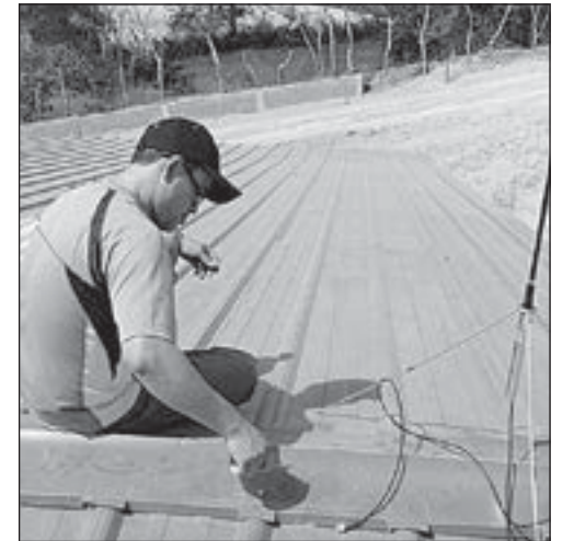
▲ A Lifeword Community Radio transmitter is installed in Diria, Nicaragua by a media trainee.