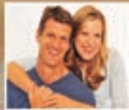
Acts of Renewal