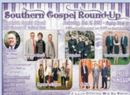
Southern Gospel Roundup Page 7