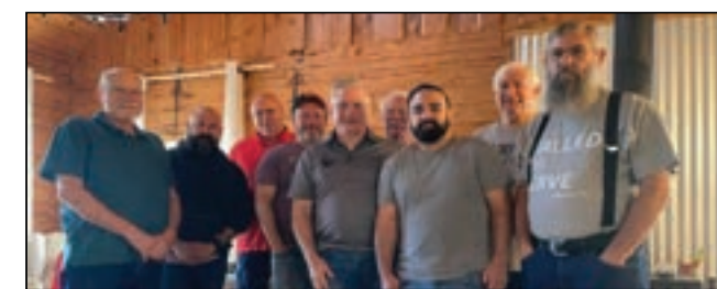
BMA TX MISSIONS continued on Pg. 4

BMAT pastors are receiving encouragement and relational connections with other pastors. He is offering missional training to pastors and churches interested in the help. We are an association of edifying relationships that glorify God and advance his Kingdom. We must be!