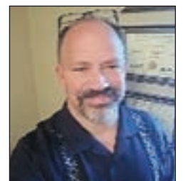
▲ Cliff Robertson

God is moving! We are seeing people want to engage and be involved in doing more with the