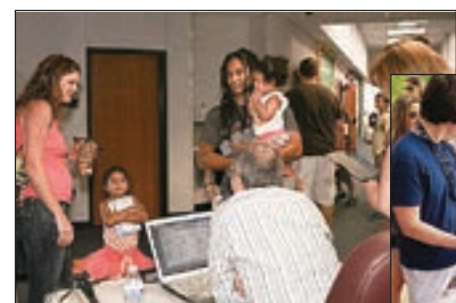
▲ Childcare check in