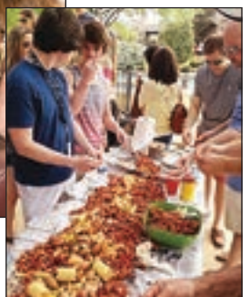
▼ Crawfish boil