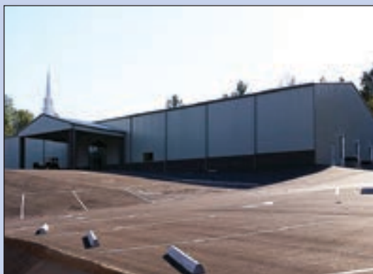
Harmony Missionary Baptist Church Page 6