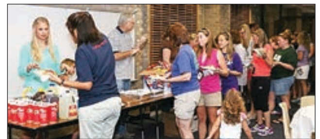
▲ Feeding teachers at Story Elementary School

Journey Community Church is a church plant of BMA of Texas Missions. For more information about the church, visit peopleonajourney.com