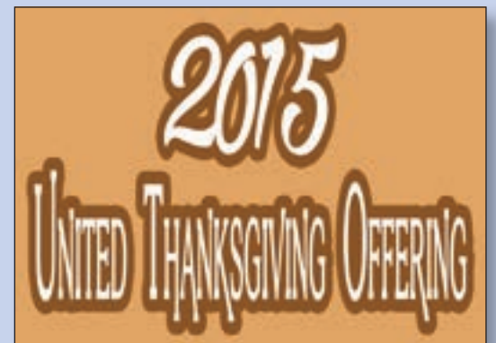
United Thanksgiving Offering Page 12