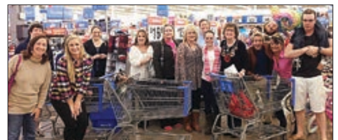
▲ Christmas shopping for needy families