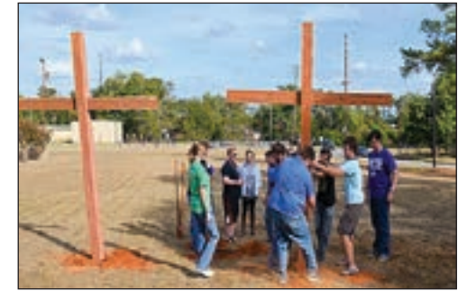
▲ The Jacksonville College Ministerial Alliance place the second of three crosses on campus. The students raised the funds for the crosses from the sale of Easter devotional books.