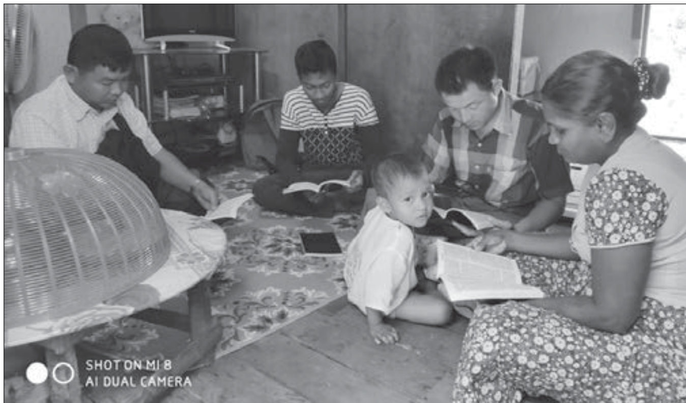
▲ Evangelistic Bible study in Myanmar