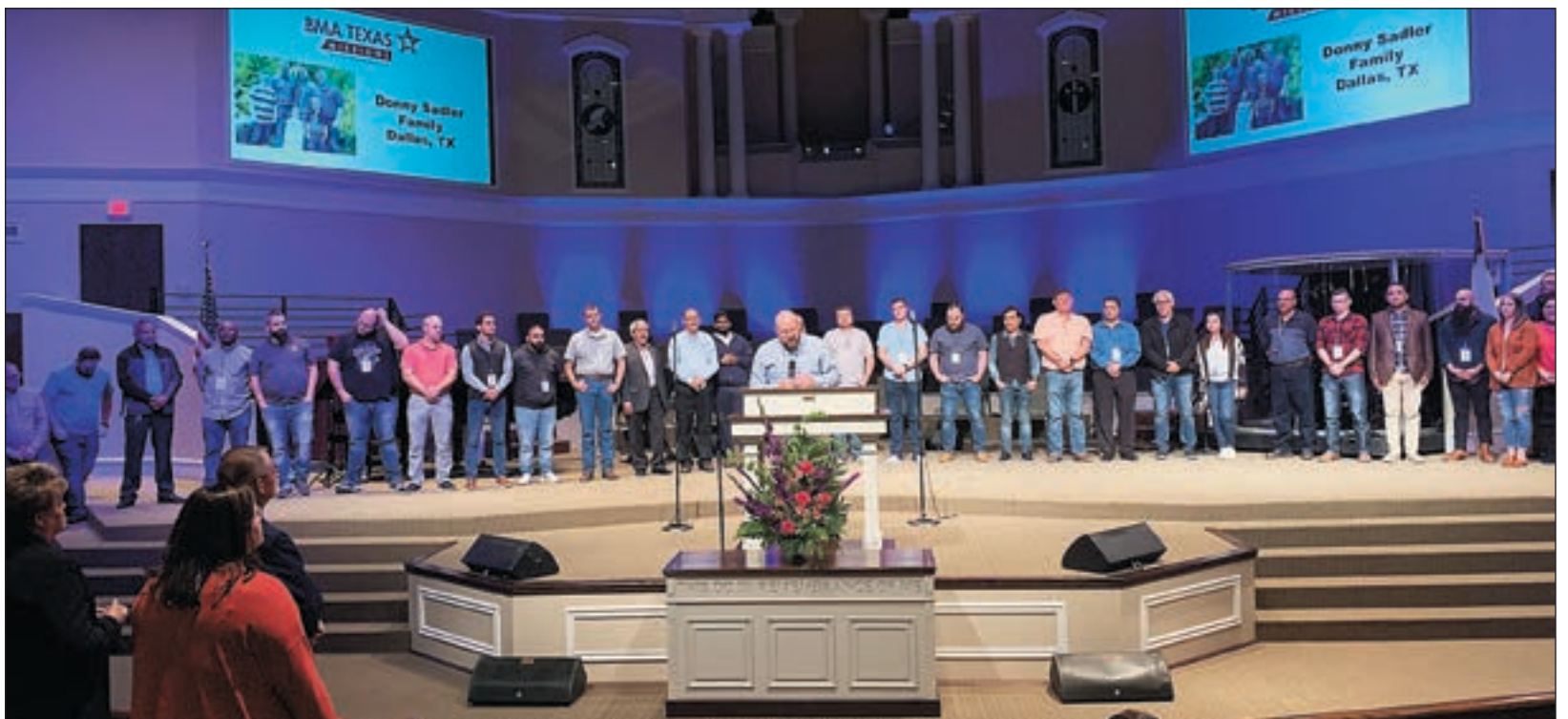
▲ BMA Texas Missions Commissioning Service