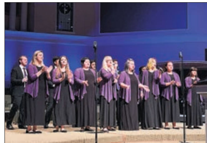
▲ Jacksonville College Singers

The 121 st Annual Meeting of the BMA of Texas will take place at New Harmony, Tyler Nov. 1-2, 2021.