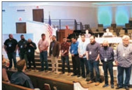
▲ Representatives of seven new churches welcomed into the BMA of Texas

A highlight of the meeting is that seven