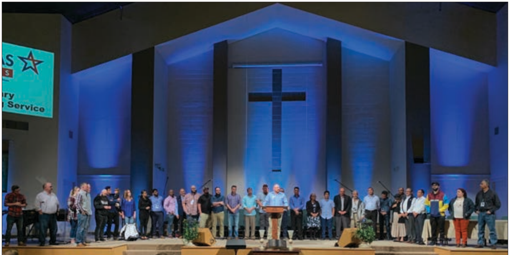
▲ BMA Texas Missions Commissioning Service