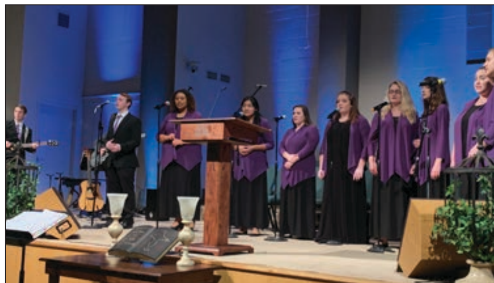
▲ Jacksonville College Choir