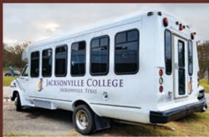
Faith Baptist Church of Malakoff blessed us with a beautiful new bus.