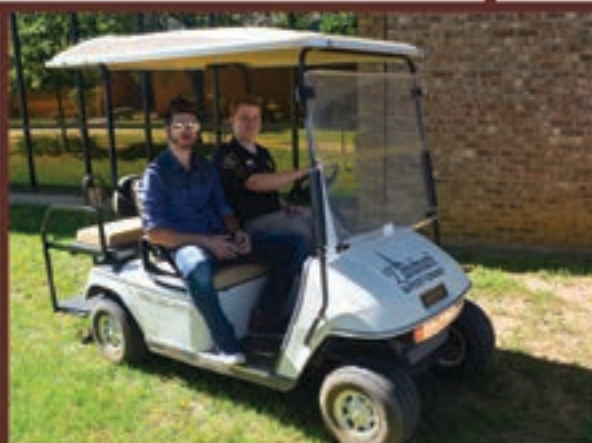
Landmark Baptist Church in Cushing donated a golf cart to facilitate coaching golf and to give campus tours to aid in recruitment.