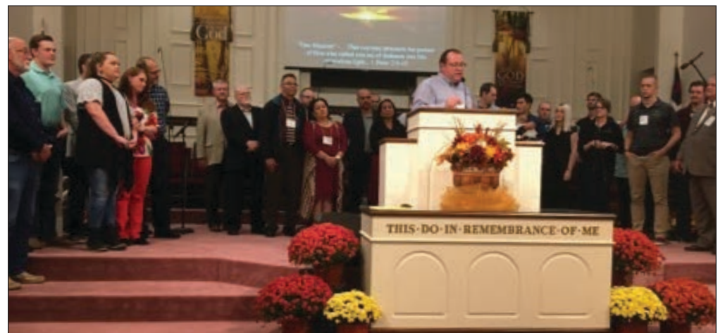
▲ Missionary Commissioning Service