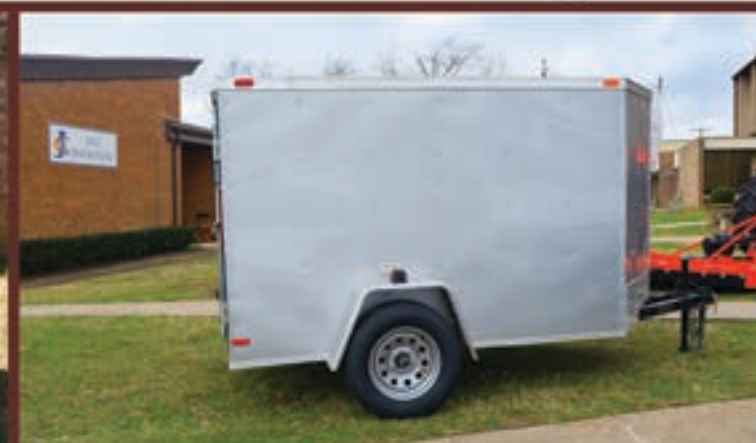
Alumni have supported the College with their time and money. JC alumnus Danny Holifield partnered with Edward Jones in Colleyville to purchase a trailer to carry the equipment for the choir and golf teams.

Our students continue to learn and serve. A large number of students participated in Disaster Relief Training on campus to be able to serve as volunteers in the Houston area and to be prepared for future disasters.