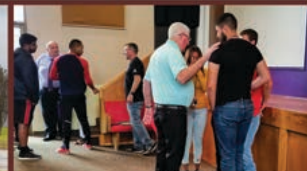
Revival continues across campus. Many students have been saved, and many others have rededicated their lives to the Lord. Almost 100 have come forward during Chapel services this semester.

WE THANK GOD FOR ALL THE ASSOCIATIONS, CHURCHES, AND INDIVIDUALS FOR YOUR PRAYERS AND FINANCIAL SUPPORT.