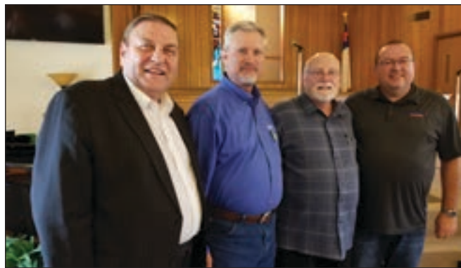
▲ Organizational pastor committee

The first official Sunday of The Church at Valley Ranch was held on Sunday, Oct. 29 with 58 in attendance. There were two salvations and one new member joined by statement. The church currently has five awaiting baptism.