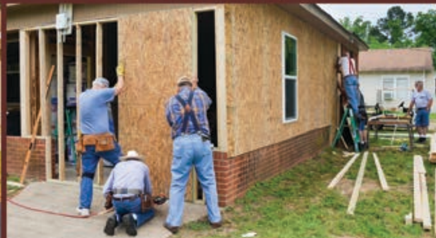
In the summer, The Master's Builders worked on several projects across campus, including enclosing structures and creating more rooms and bathrooms for student housing.