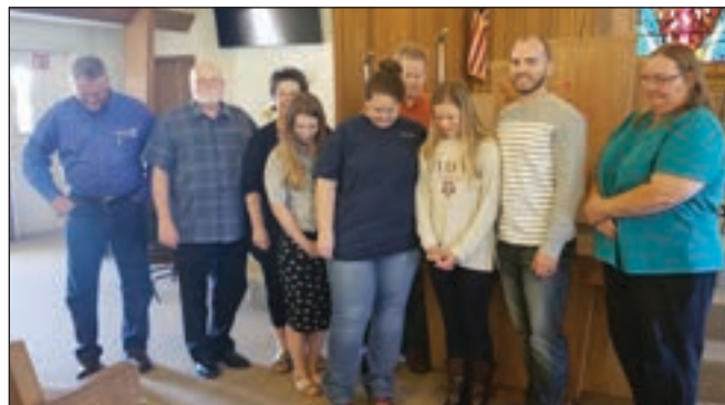
▲ The Church at Valley Ranch members praying