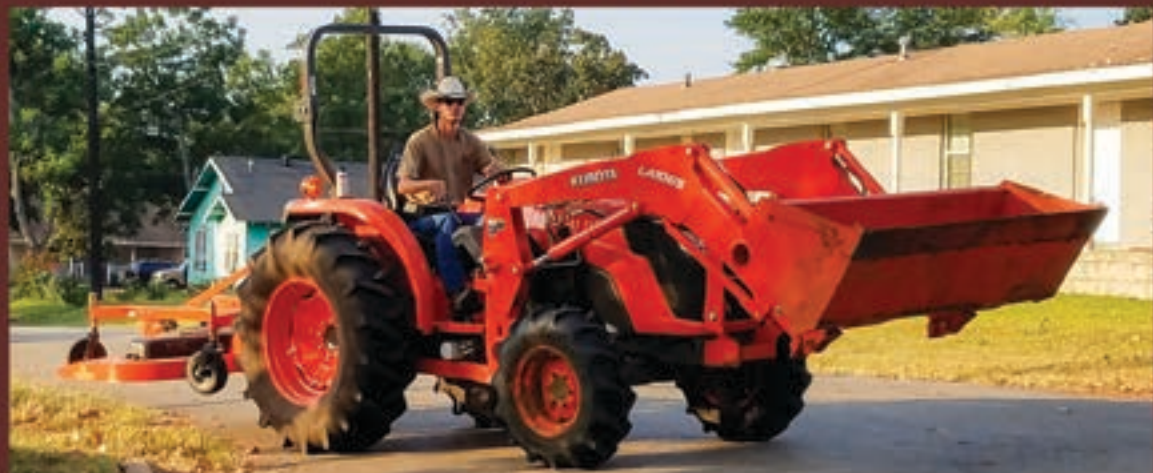
The Texas Women's Missionary Auxiliary raised over $25,000 and purchased a new Kubota tractor for Jacksonville College.

"I WILL GIVE THANKS TO THE LORD WITH MY WHOLE HEART; I WILL RECOUNT ALL OF YOUR WONDERFUL DEEDS" (PSALM 9:1).