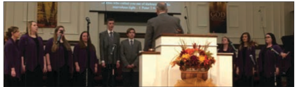
▲ Jacksonville College Choir