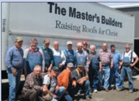
Master's Builders Page 6