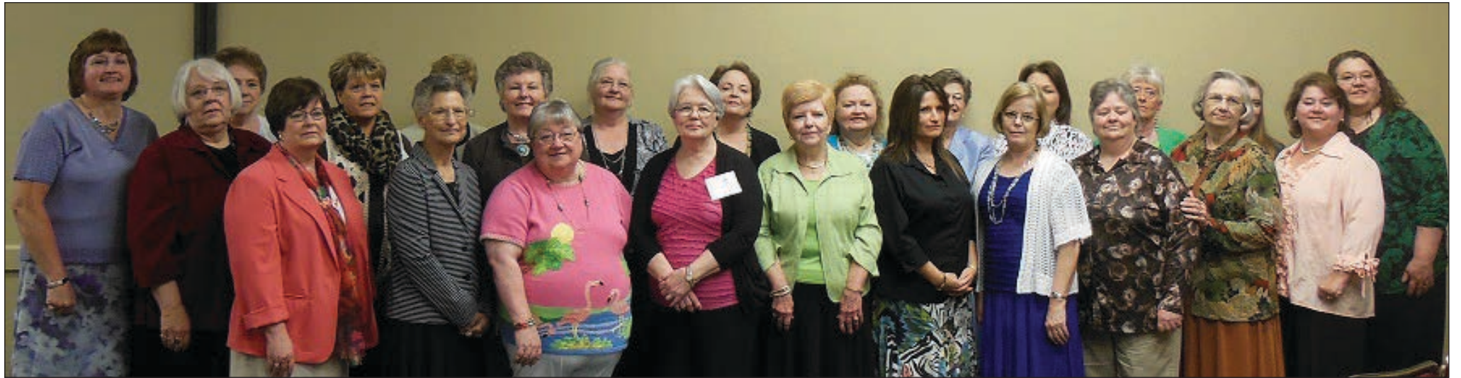
▲ 2014-15 National WMA Officers