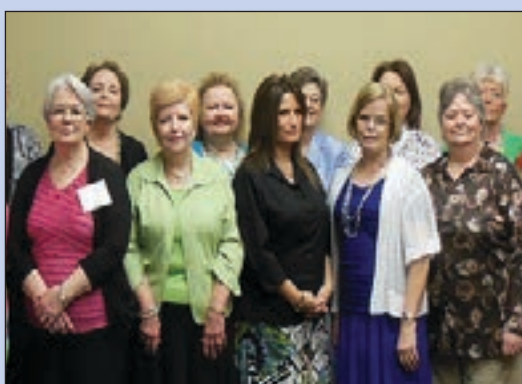
WMA National Meeting Page 7