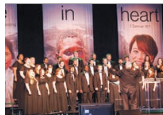
▲ Central Baptist College Choir sang Wednesday evening