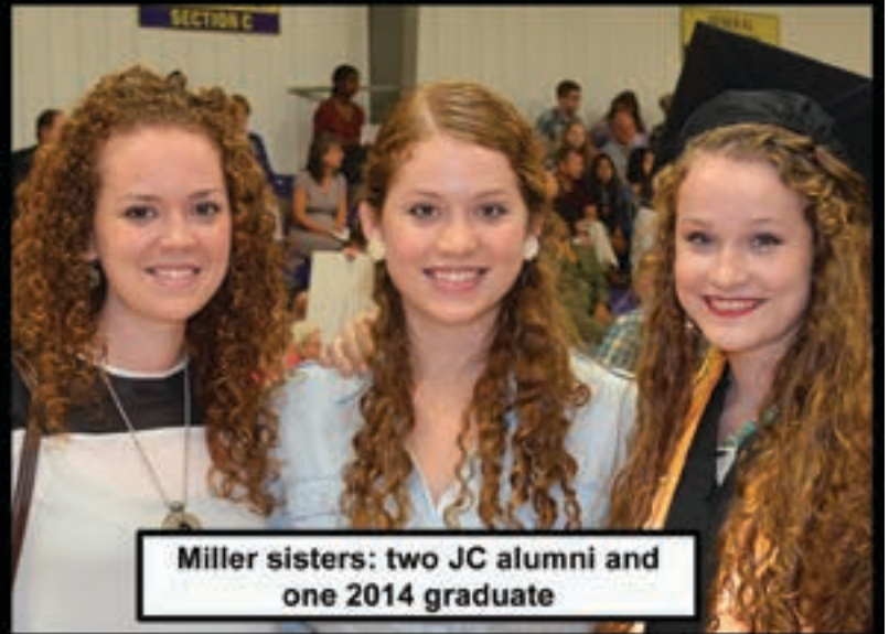
Miller sisters: two JC alumni and one 2014 graduate