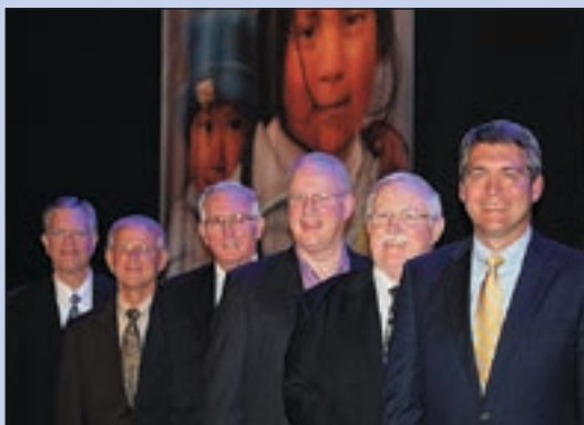
65th BMAA Annual Session Page 6