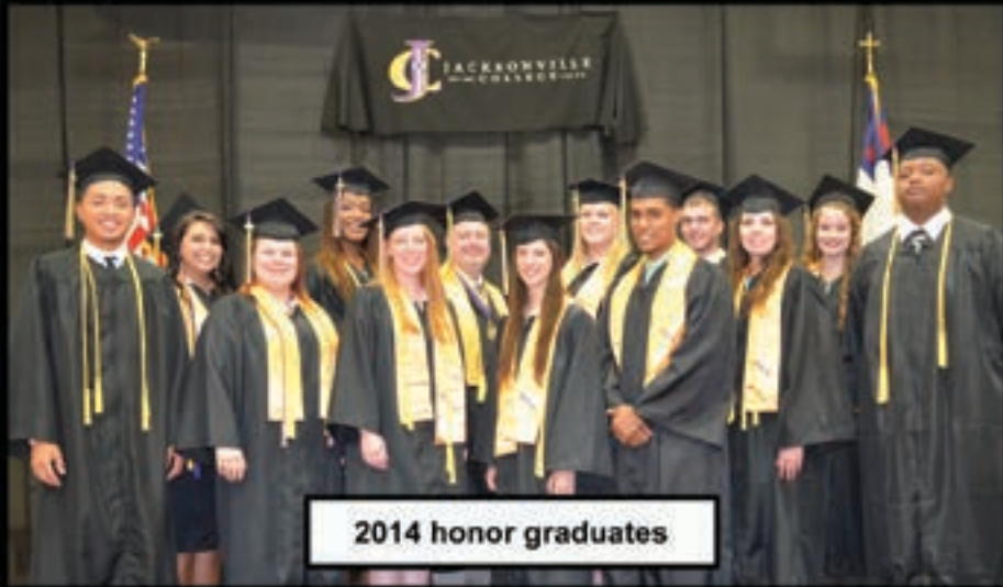
2014 honor graduates