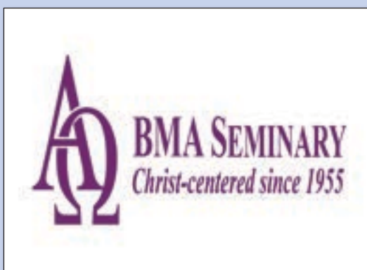
BMA Seminary’s 57th Commencement Page 7