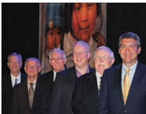
▲ 2014-2015 BMAA officers