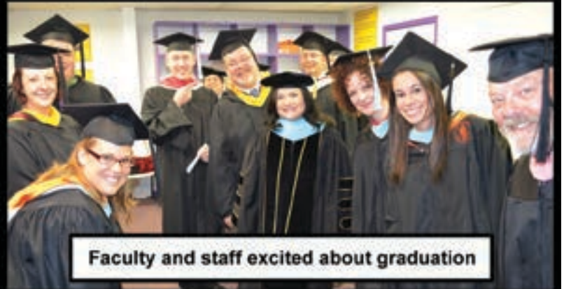
Faculty and staff excited about graduation