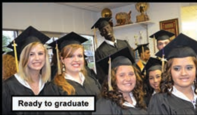
Ready to graduate