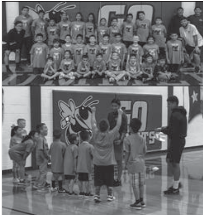
▲ 2019 New Summerfield ACE Program Soccer Clinic

On Saturday, April 6, the athletes hosted the 2019 New Summerfield ACE Program Soccer Clinic for children from kindergarten through 8th grade. The Texas Afterschool Centers on Education (ACE) program offers free afterschool programming to economically disadvantaged schools across the state, and the soccer clinic was a fun way for children to learn new skills and enjoy interacting with college soccer players.