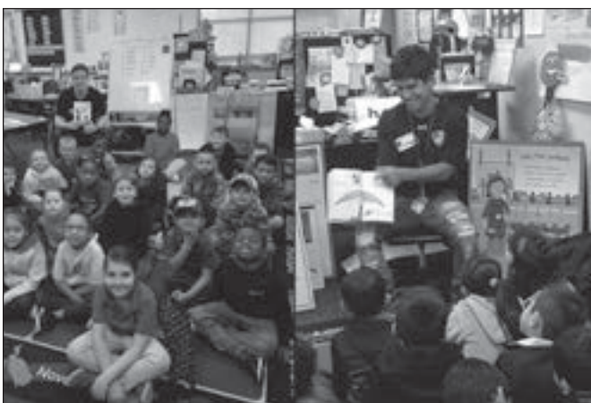
▲ Soccer player reading to elementary students during Read Across America Week

In March, soccer players read Dr. Seuss books to children from Fred Douglass, Joe Wright, West Side, and East Side elementary schools in Jacksonville as part of Read Across America Week.