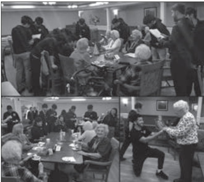
▲ Soccer players celebrate February birthdays for residents at the Angelina House in Jacksonville.

In February, the men's and women's soccer teams visited Jacksonville's Angelina House senior living community to help celebrate the birthdays of residents with February birthdays. The students made special memories with the residents by singing with them, talking with them and encouraging them, and enjoying birthday refreshments with them.