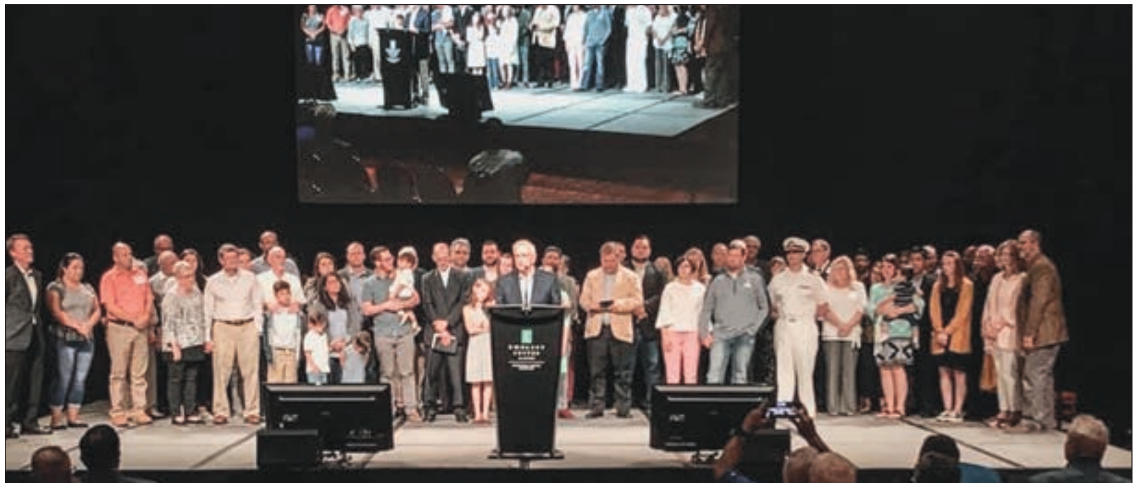
▲ BMA of America Missions Commissioning Service