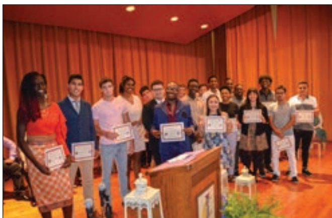
▲ Twenty-six Jacksonville College athletes were named to the NJCAA Region 14 All-Academic Team this year. Pictured are 20 of these students.