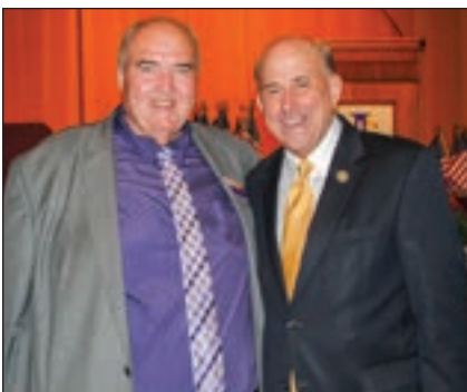
▲ Congressman Louie Gohmert, a deacon and Sunday School teacher at Green Acres Baptist Church in Tyler, frequently speaks or preaches at churches throughout his district and around the country. On March 28, he spoke in Chapel and challenged guests to stand firm in their faith in Christ and the Word of God.