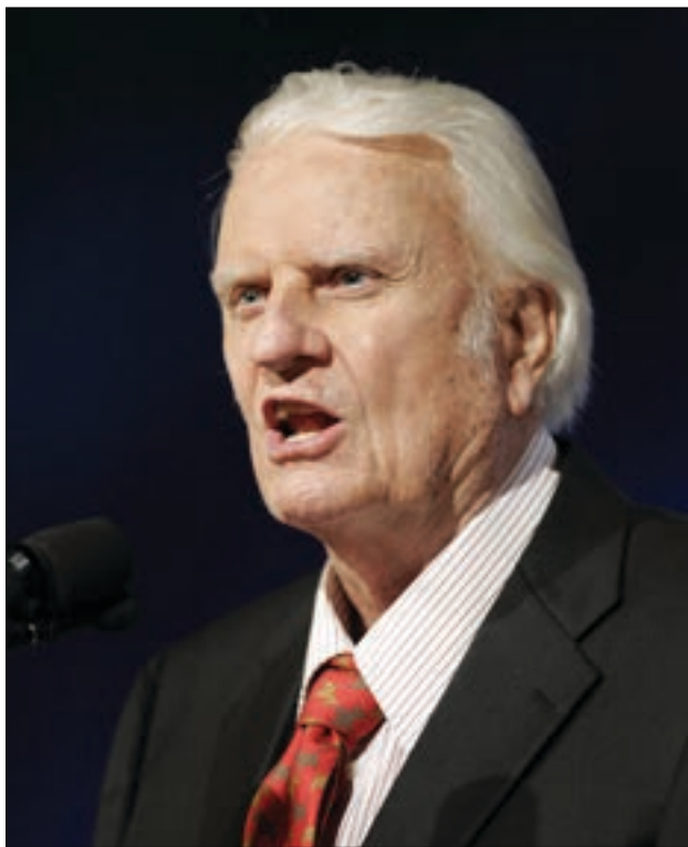
▲ Dr. Billy Graham

And he walked into the presence of God, and in the presence of millions of people who said "yes" to Christ at a Billy Graham Crusade.