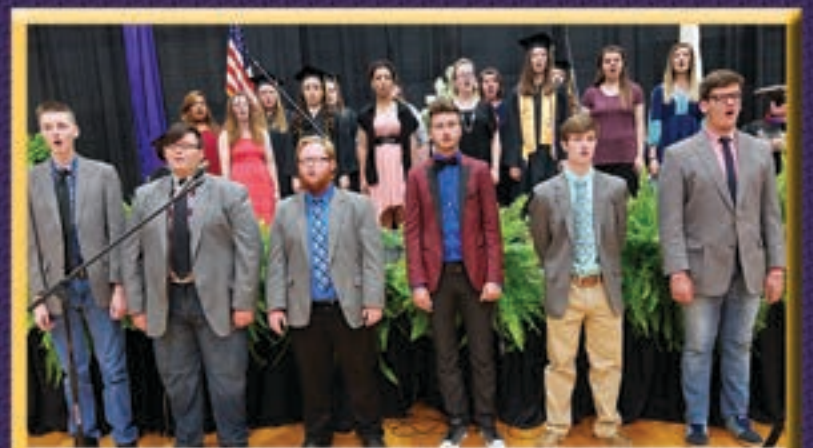
Jacksonville College Choir singing the JC alma mater