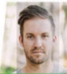
MUSIC WE THE UNION

GRAYLORD TEXAN RESORT | $125 PER ROOM (LIMITED AVAILABILITY)