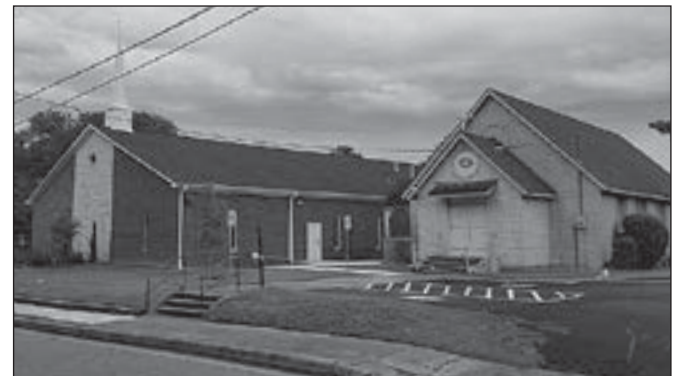
▲ Building Exterior