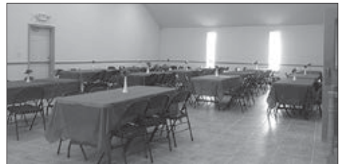
▲ John May Fellowship Hall