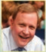
BRENT SUMMERHILL INSPIRATION TRACK