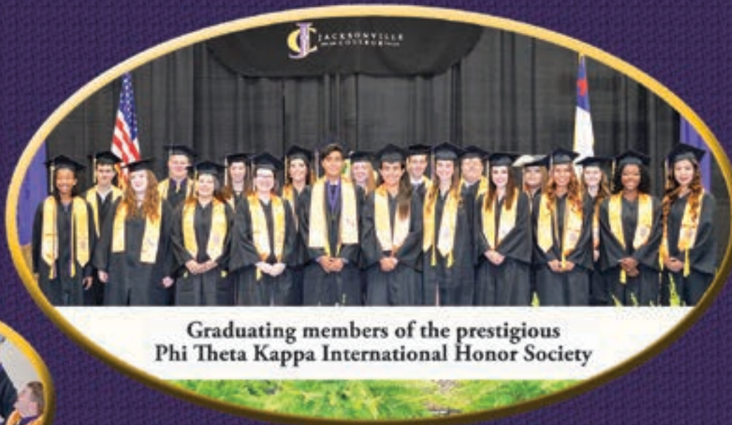
Graduating members of the prestigious Phi Theta Kappa International Honor Society