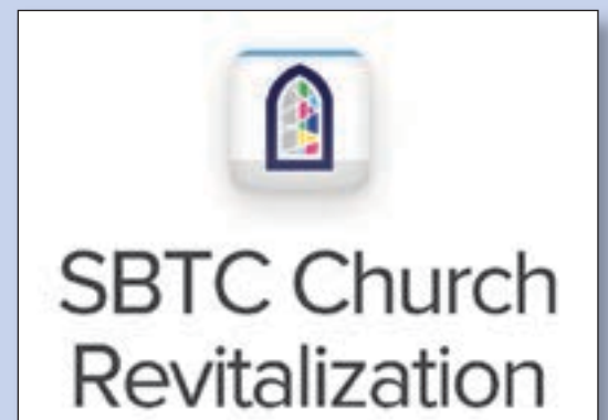
SBTC Church Revitalization Page 12