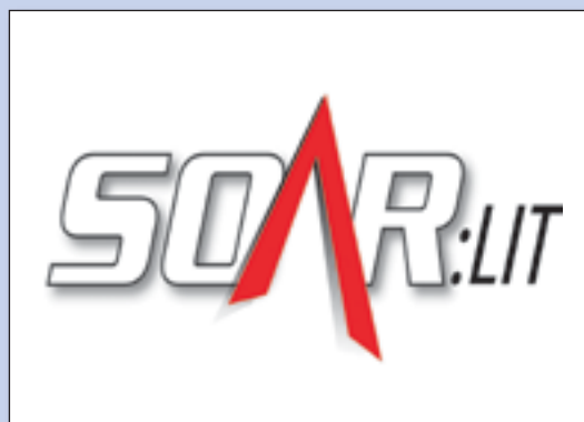
Spring Edition of SOAR:LIT Page 7