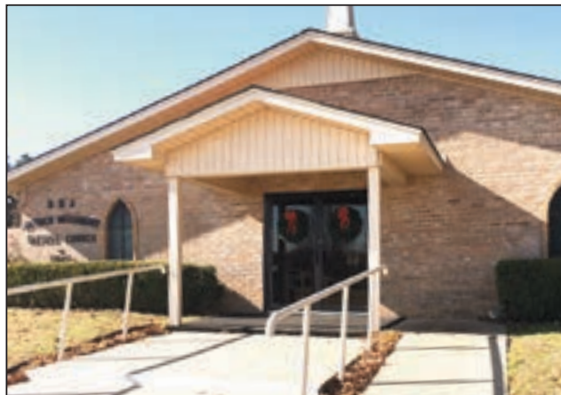
▲ Antioch Baptist Church, Gilmer