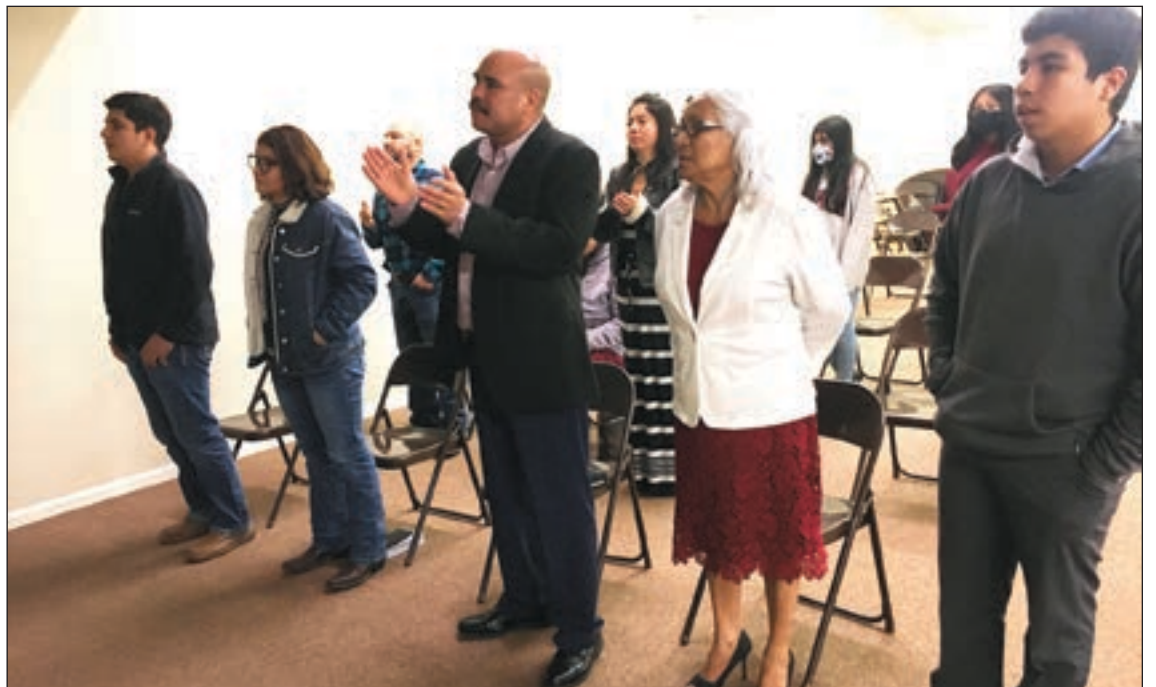
▲ Iglesia Bautista Nueva Vida Mission worshipping