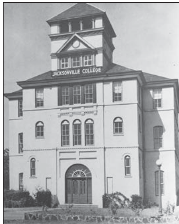
▲ Jacksonville College's Old Main was constructed in 1899 and razed in 1968 to accommodate modern structures. The Old Main bell was housed in the tower of the building.

Join us at Homecoming on Feb. 9-10, and be prepared to share your "bell" stories. You will have plenty of time to visit and reminisce. Register online now at jacksonville-college.edu/alumni .