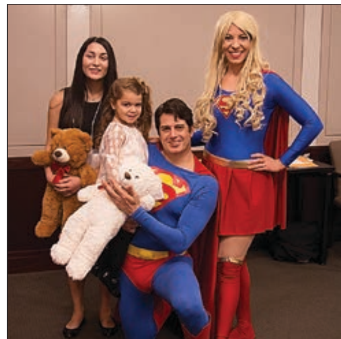
▲ Photo is from National Adoption Day with two of the eight children that were adopted by TBHC families that day.

You can help care for and protect the sanctity of life for our kids by signing up for the TBHC 5K. What does a 5K and sanctity of life have in common? Well, all the funds raised for the TBHC 5K will go to help adoption families who have adopted children that may need extra services after they have been adopted. Our children have been through so much in their short lives and we want to care and give them a hope for a successful future. The families rely on TBHC services and you as the supporter help make that happen. You are one of the many superheroes that take care of TBHC kids and we cannot wait to see you at the TBHC 5K on Jan. 20, Superhero costumes and all.