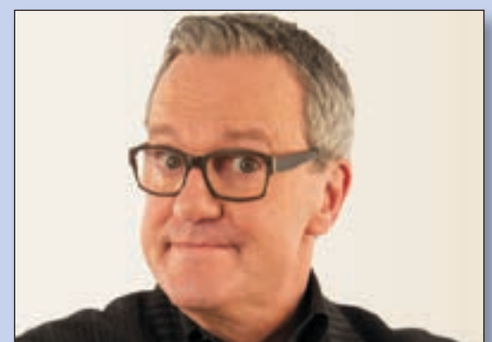
Senior Adult Joy Fest Page 12