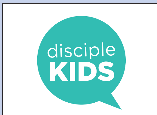
DiscipleKids Page 12