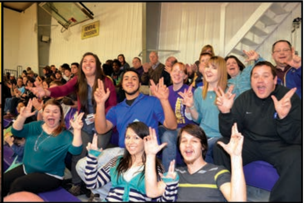
Alumni showing the JC spirit at the homecoming game