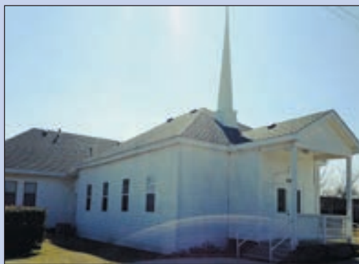
Sardis Celebrates 120 years Page 6