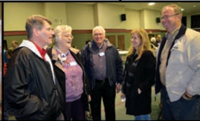
Sharing memories of Jacksonville College