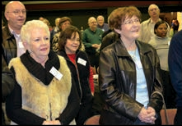
Gathering for fun and fellowship in the FBC Family Life Center