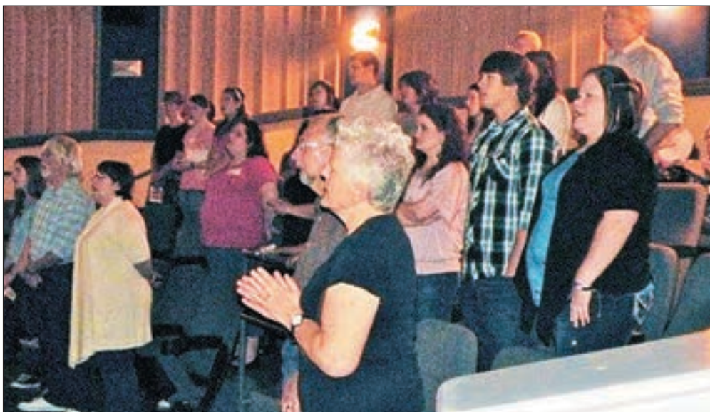
▲ Worship at The Refuge