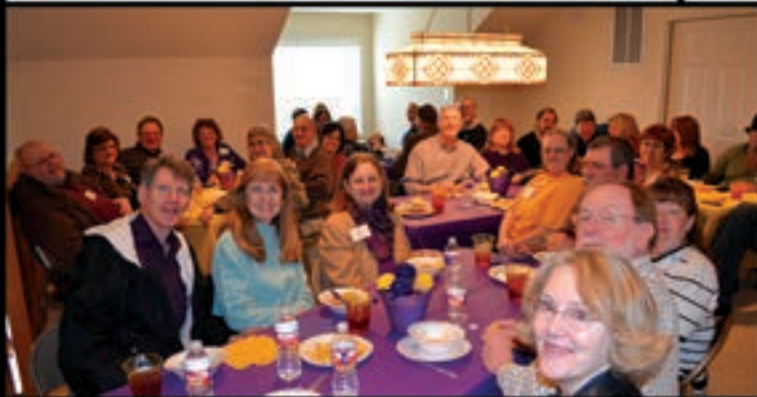
Bonner-Gaylor alumni chapter