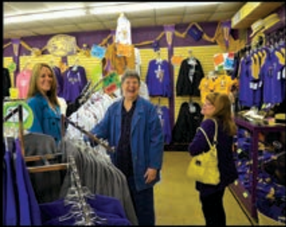
Fun shopping in the Jag Bookstore