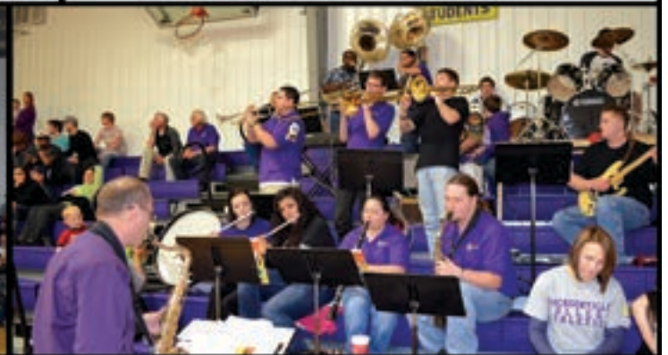
Jag Band promoting school spirit with lively music