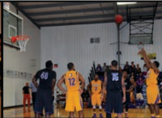
Jaguar Homecoming game