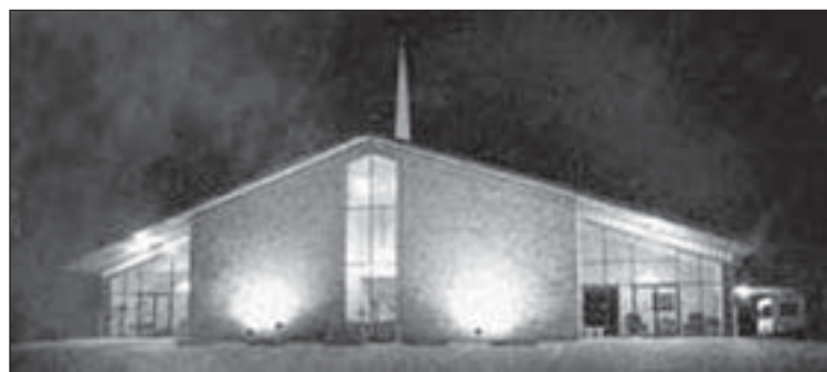
▲ Rosewood, Gilmer