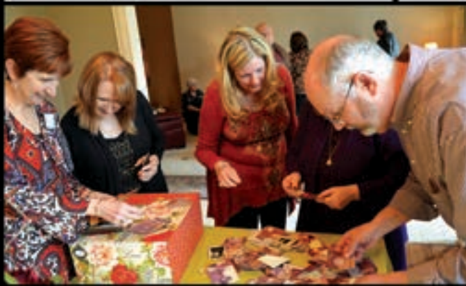
Enjoying pictures from the past