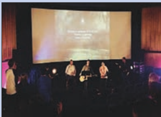
Launch service at The Refuge Page 2