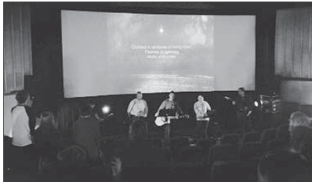
▲ The Refuge in worship on official launch day

TERRELL, Texas—Since the start of The Refuge Church in Terrell two years ago, they have experienced blessing after blessing from The Lord. January marked their official launch. One week before the launch service, church members met together and distributed flyers promoting the church and inviting the individuals to attend. Also, The Terrell Tribune published an article on their cover page about the launch service. When the day finally came, The Refuge welcomed 73 people with 23 of those being first time visitors.