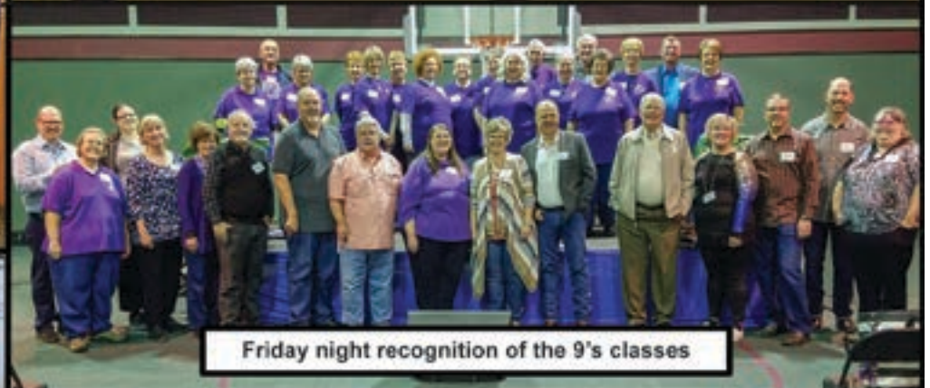
Friday night recognition of the 9's classes