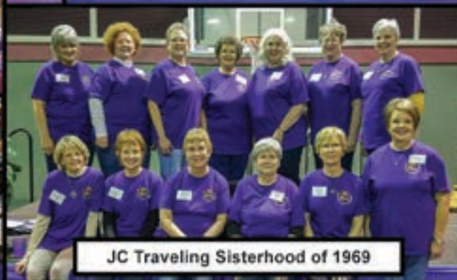
JC Traveling Sisterhood of 1969