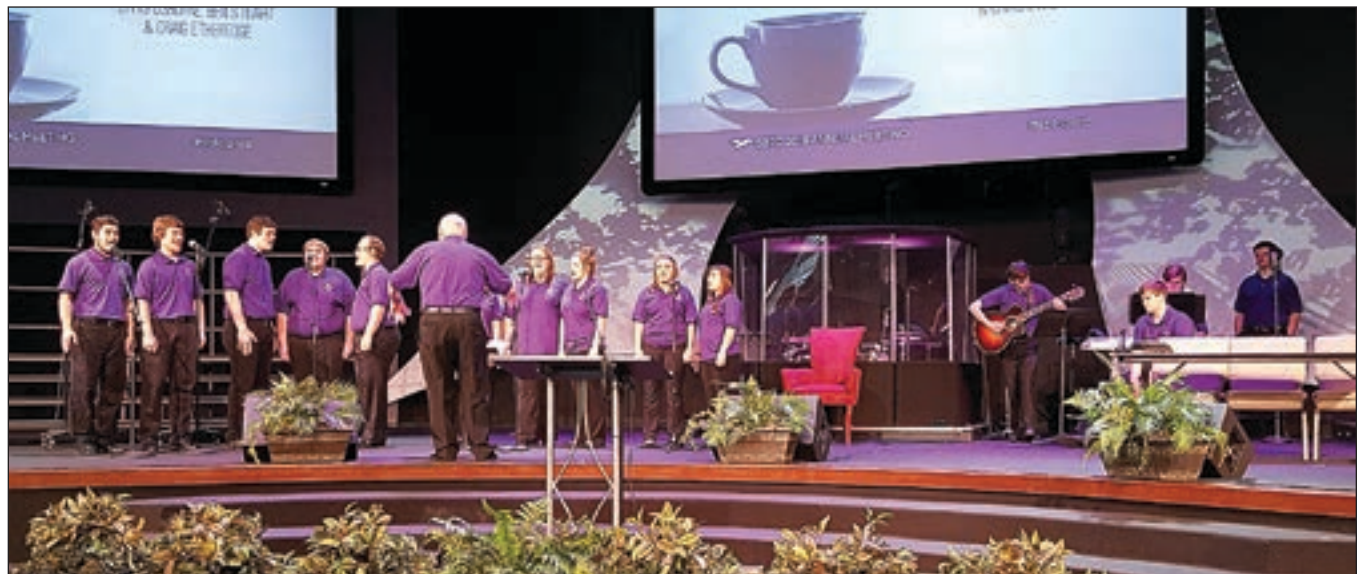
▲ Jacksonville College Singers and instrumentalists performing at the Ministry Café during the Southern Baptists of Texas (SBTC) 2015 Bible Conference on November 9