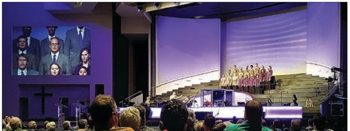
▲ The Jacksonville Choir singing during the historic joint worship service of the BMAT and SBTC on November 10.