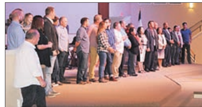
▲ State Missionaries