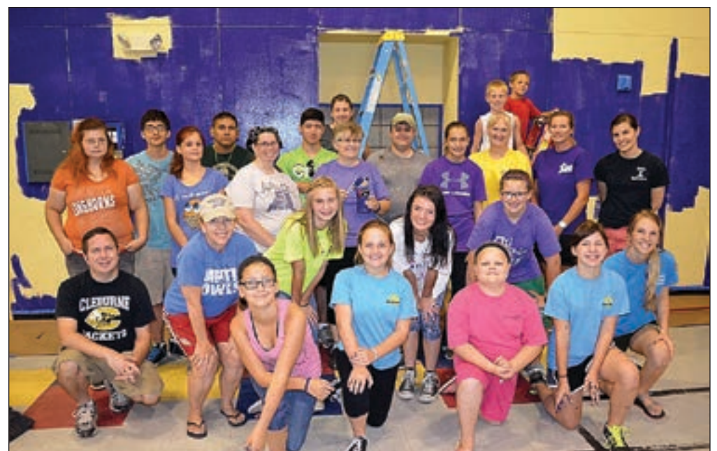
▲ The North Cleburne Baptist Church’s youth group and the Van Zandt District GMA group painted the new JC weight lifting room on the Joe Wright Campus this summer.