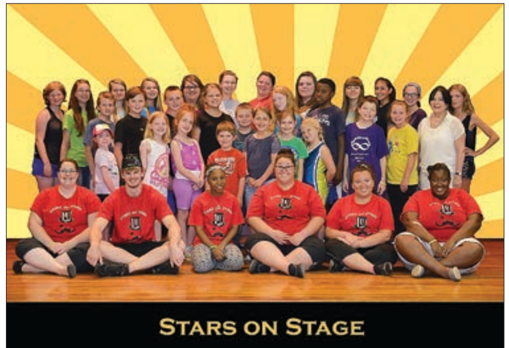
▲ The Jacksonville College Theater Department held its seventh summer theater camp June 22-26. Children in Grades 2-12 enjoyed five days of adventure, excitement, and performance. The camp ended with a special performance on Saturday, June 27.

for admission is available for new students, and current students may register for classes online.