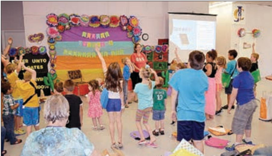
▲ Sunbeams enjoyed learning songs in Spanish and English at the Texas Sunbeam House Party at Jacksonville College July 17-18. The theme this year was "Fiesta Sunbeams."

The Texas Sunbeams thank you and the college for allowing us to have our state meeting at your facility. The children always look forward to staying on campus, knowing one day they may get an opportunity to go to JBC. God Bless You!"