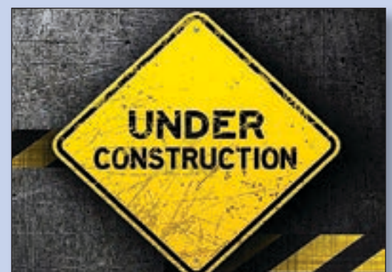
Texas WMA Retreat Page 12