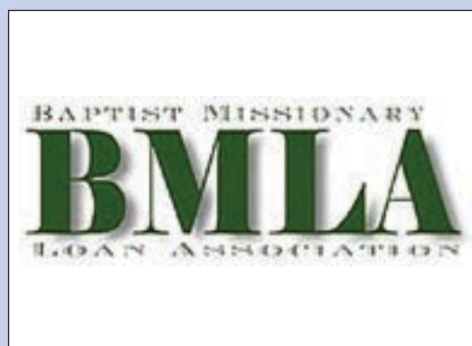
Baptist Missionary Loan Association Page 7