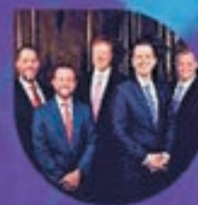
GOLD CITY CONCERT