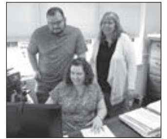
▲ Baptist Publishing House staff

Baptist Publishing House is excited to share some great news with you! We have had a very strong start and are already seeing orders for the fall quarterly come in via our new, easy-to-use website ( baptistpublishinghouse.com ). We have been encouraged to see some churches who have not ordered BMA material in several years return to us. We have also seen many churches increase their orders. This is very encouraging and we would like to thank our churches for their overwhelming support.