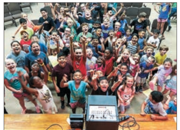
▲ Cornerstone Baptist Church of Jacksonville hosted its Vacation Bible School, Rock the Block, on Jacksonville College's East Campus in June.