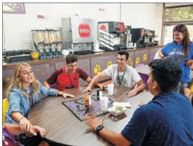
▲ JC students having fun playing Pulse in the cafeteria before the start of the Fall semester