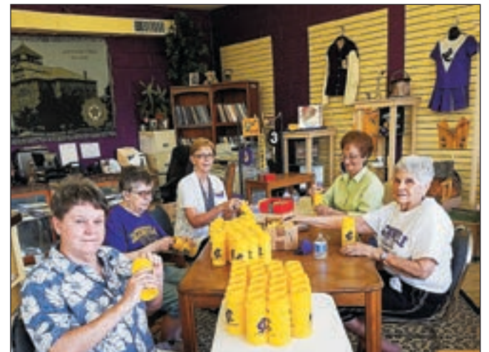
▲ In the JAG Store, volunteers prepared welcome gifts to give students during Fall Orientation.