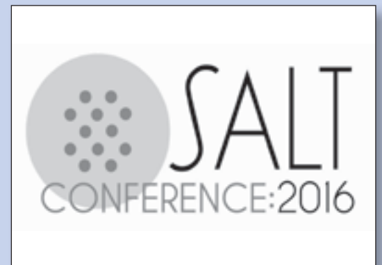
Salt Conference 2016 Page 12