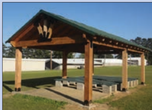
Daniel Springs Camp Page 7