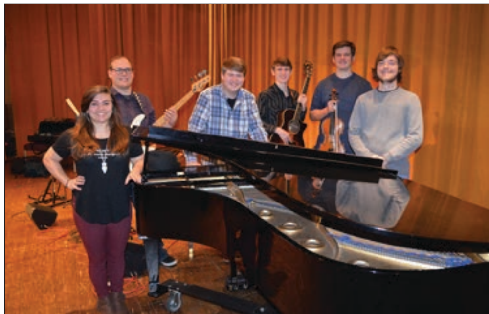
▲ Until He Comes, the Jacksonville College praise and worship team.