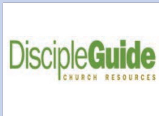
DiscipleGuide Page 5