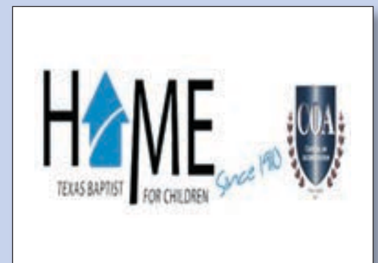
Texas Baptist Home Page 8