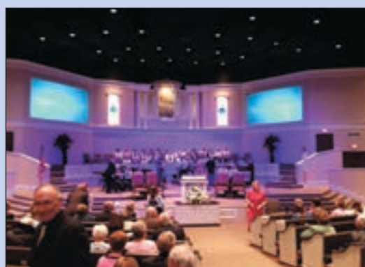
Farley Street dedicates new building Page 6