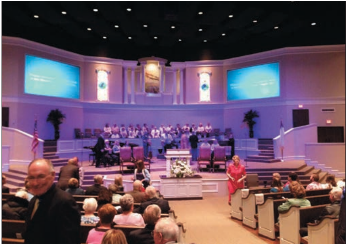
▲ Visitors and church members of Farley Street began filling the facility for the historic service. An estimated 700 people attended the service.

For further information about the church, visit the website at www.farleystreet.com , or call the church office at 972-935-0000.